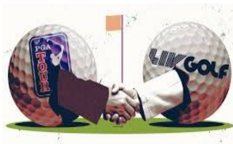
Is "Golf's Cold War" finally over? What does that mean for the Buckeye State? What does that mean for my golf game?