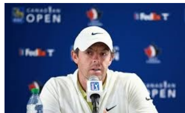
PGA Ambassador Rory McIlroy, looking confused