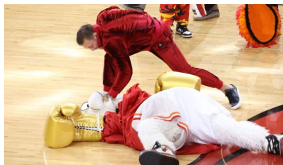
Alternative angle of the attempted murder... errrr...I mean "skit"