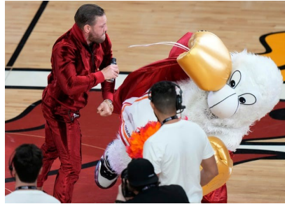
Harmless loudmouth or vengeful killer?