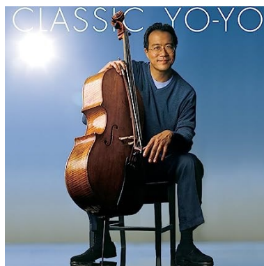
Another famous Yo-Yo (not currently seeking relocation to Buckeye).