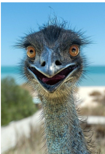
(This is not a picture of Mark... but all emus look basically the same, so please use this photo for reference for what you are looking for as you look for Mark.)

The sheriff is working with ODNR and the OHP to oversee the search. They are encouraging citizens to report any sightings to their local authorities.