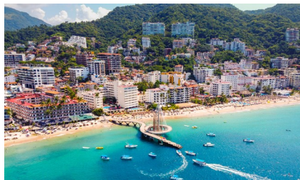
Puerto Vallarta is defined by the natural charm of its beaches embraced by the Sierra Madre mountains; its culture, gastronomy, and the warmth and hospitality of being welcomed like a friend.