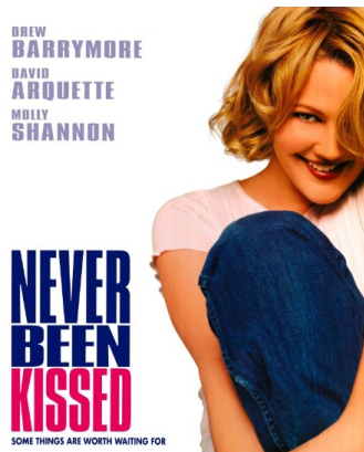
(Wasn't this a movie? Yeah, the girl from ET was in it. It was mid)

“The school system will enhance processes to determine the authenticity of enrollment documents for current and future students as well as modify policy and procedures as warranted,” the school system said in a statement late Friday.