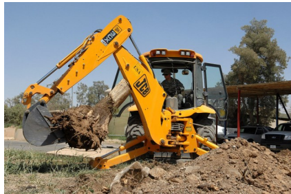
A backhoe doing backhoe things. Like lifting stuff and putting it back down somewhere else