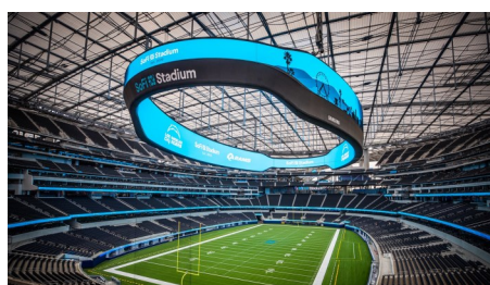
SoFi Stadium in LA has a full LED roof, a two-sided infinity video board, a champagne bar, and a $5 Billion price tag to go with it