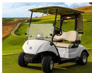
Boasting 105 amp hours per single charge, the Drive 2 PowerTech Li promises to spend more time on the streets of Oxford than any other golf cart