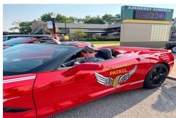
The aforementioned sweet cherry red Corvette

The Dept of Public Safety and Inspector General are both expected to investigate the stop and present any suggested changes to department policy by Friday.