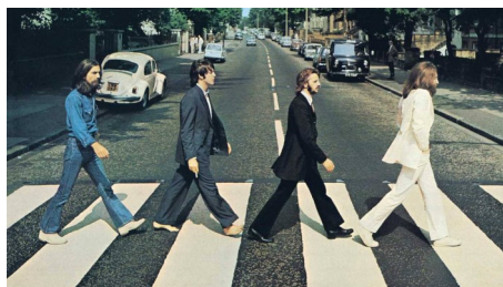
For those unfamiliar, the Beatles were like your grandparent's Drake, but with British accents

Can it happen? I guess that's up to the governor and the state agencies.