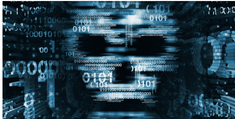
A scary looking cybersecurity pirate like face. Ooooh spooky!

Advocacy groups are calling on the Governor to create a Cybersecurity Taskforce to address future threats to government operations. This group would likely included leaders from the